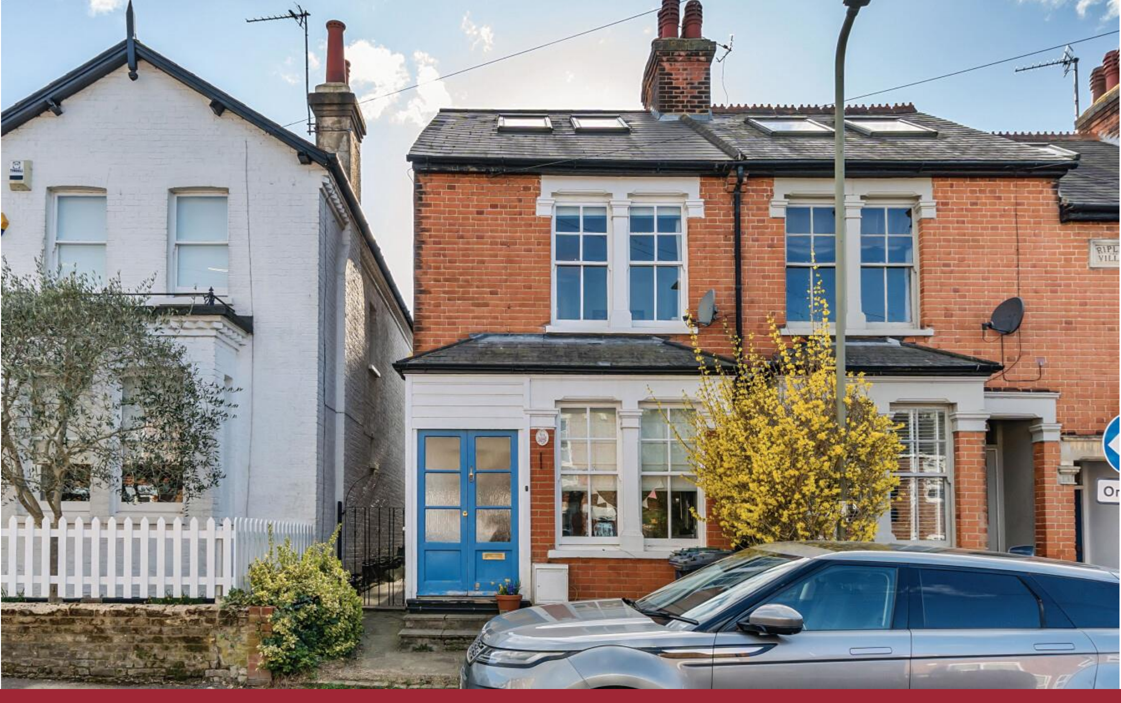
Sebright Road, Barnet, EN5