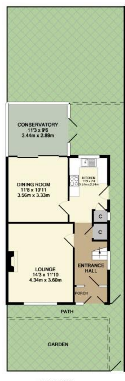
CROUND FLOOR APPROX. FLOOR AREA 795 SQ.FT (73.9 SQ.M.)

020 8368 7138 www.hunters-whetstone.co.uk