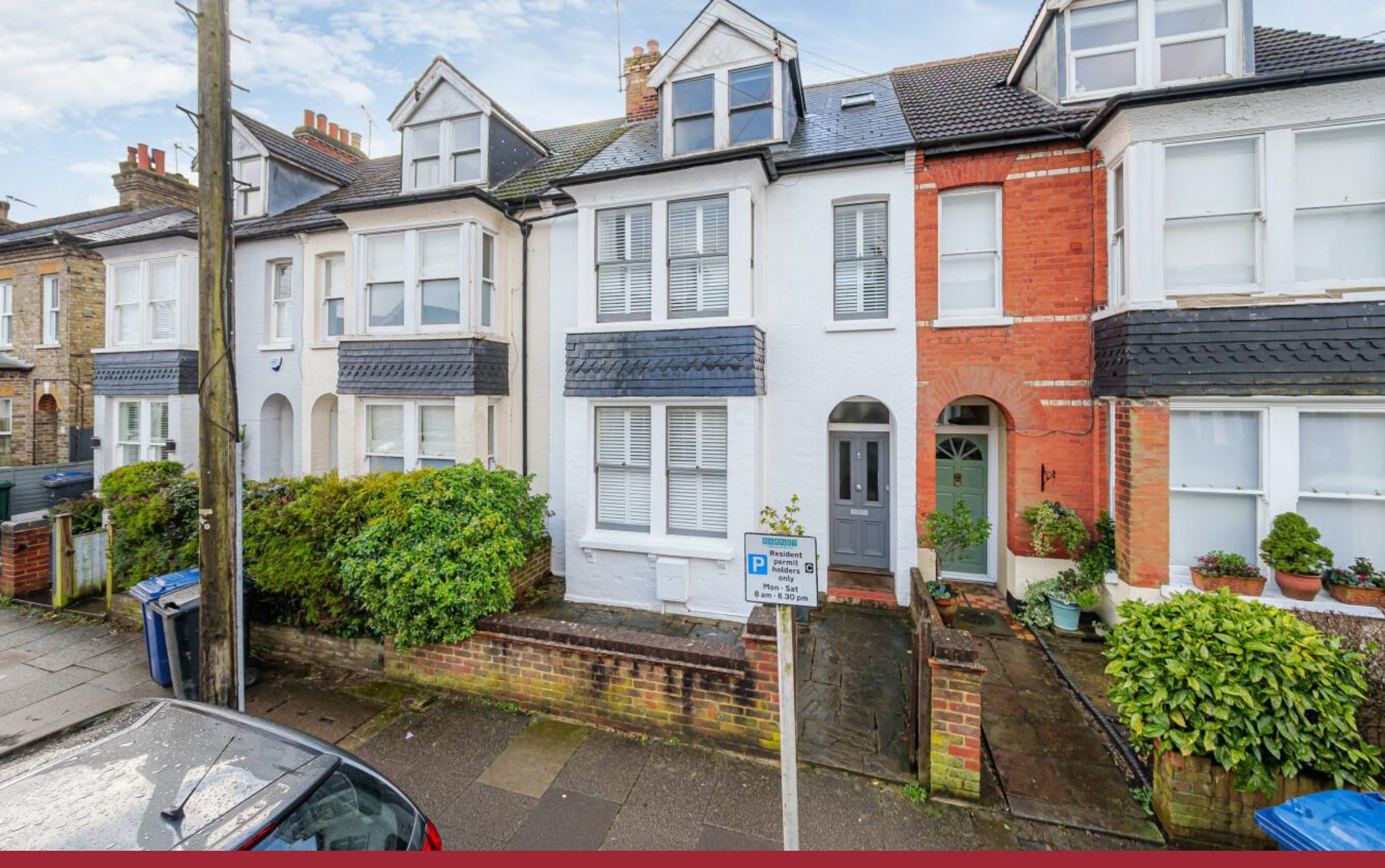
Salisbury Road, Barnet, EN5