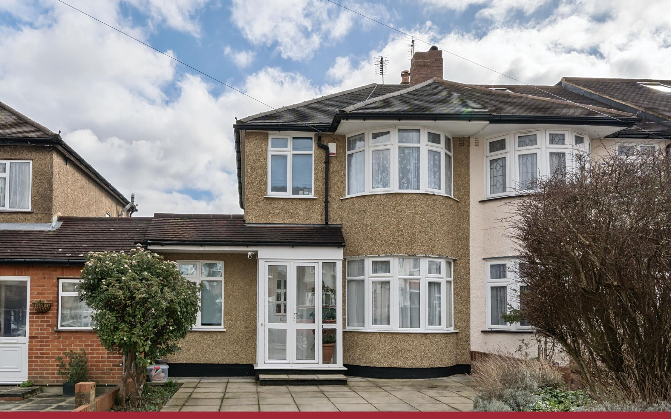
Burlington Rise, Barnet, EN4 8NN