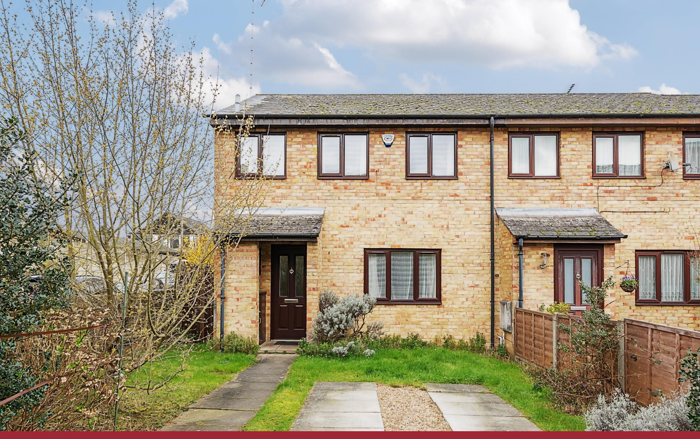
Leicester Road, Barnet, EN5