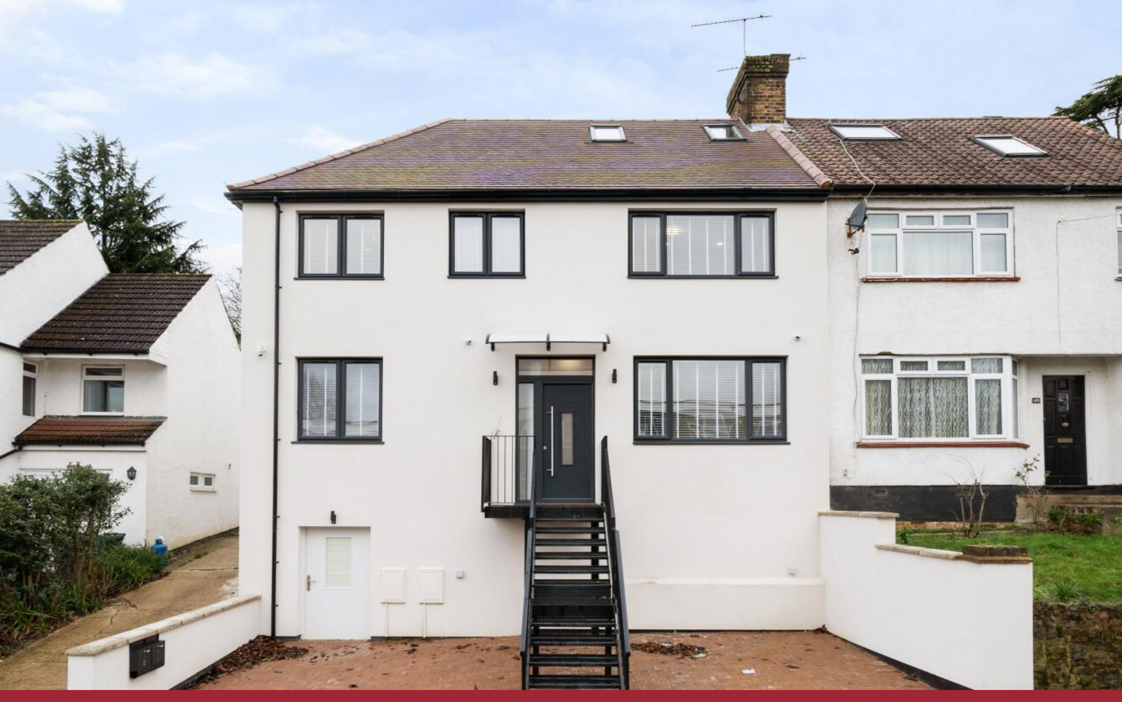
Warwick Road, Barnet, EN5

Asking Price: £700,000 Share of Freehold