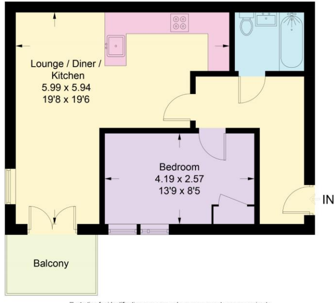
Illustration for identification purposes only, measurements are approximate, not to scale. floorplansUsketch.com © (ID1073644)

Approximate Gross Internal Area = 48.5 sq m / 522 sq ft