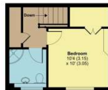
FIRST FLOOR APPROX FLOOR AREA 21.5 SQ M (232 SQ FT)