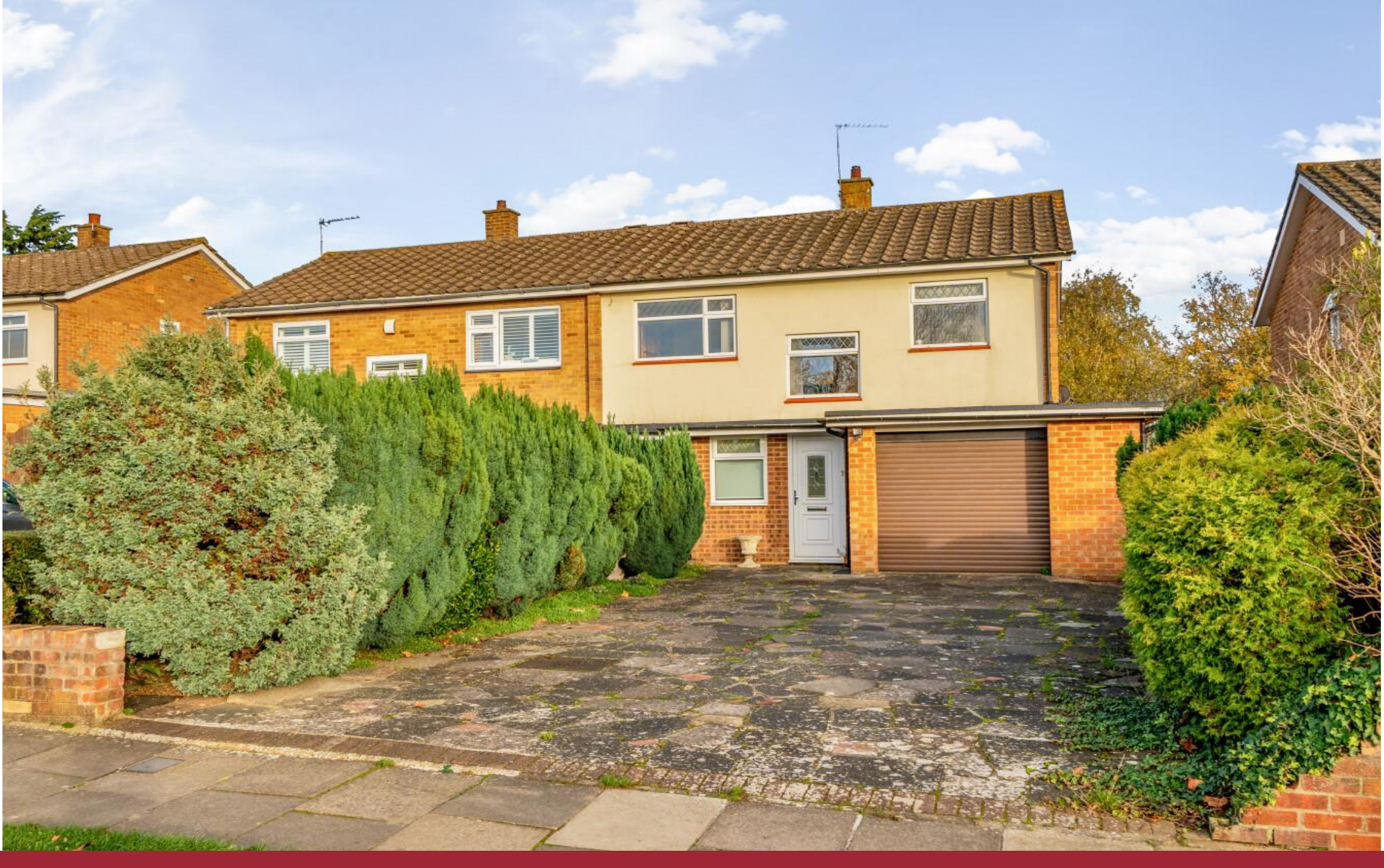
Leeside, Barnet, EN5