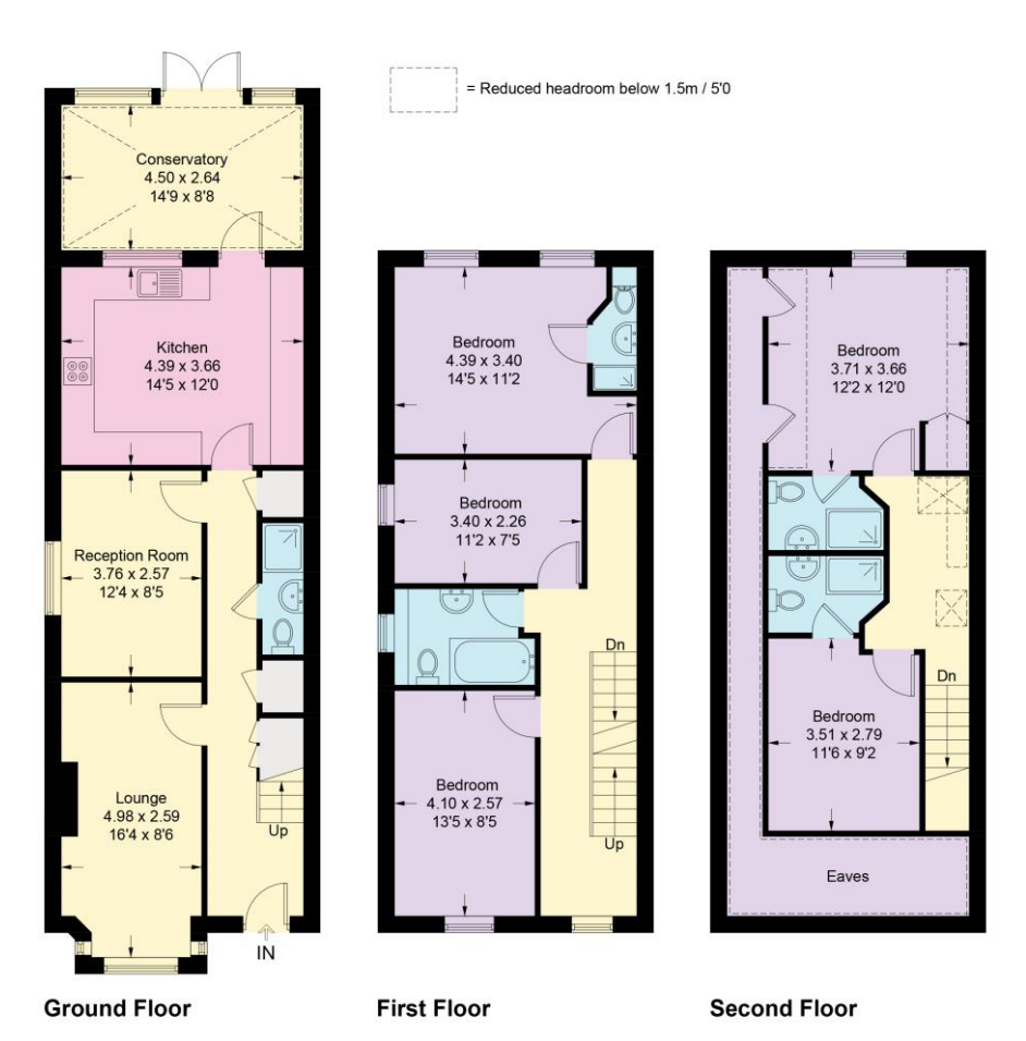
Illustration for identification purposes only, measurements are approximate, not to scale. Fourlabs.co @ (ID1143082)