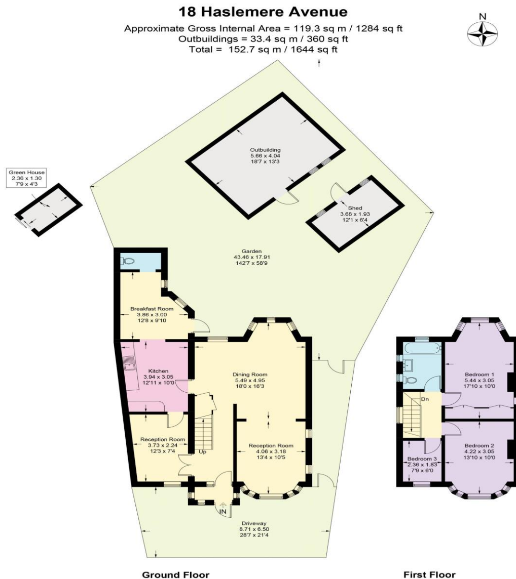
Illustration for identification purposes only, measurements are approximate, not to scale. (ID1139246)