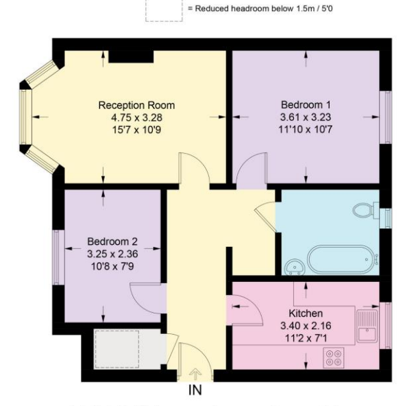
Illustration for identification purposes only, measurements are approximate, not to scale. Fourlabs.co © (ID1186281)

Approximate Gross Internal Area = 60.9 sq m / 655 sq ft