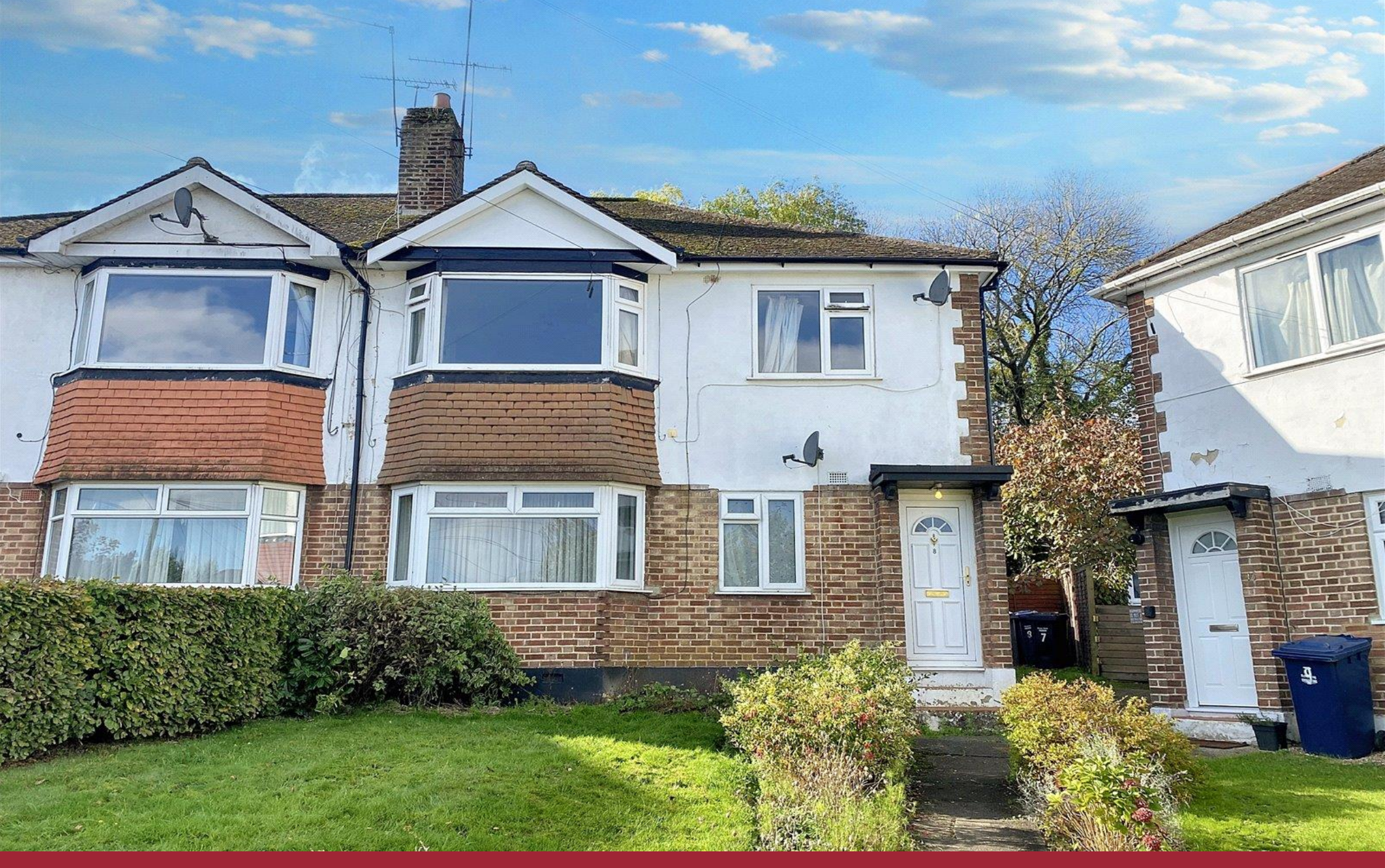
Meadway Close, Barnet, EN5

Asking Price: £385,000 Share of Freehold