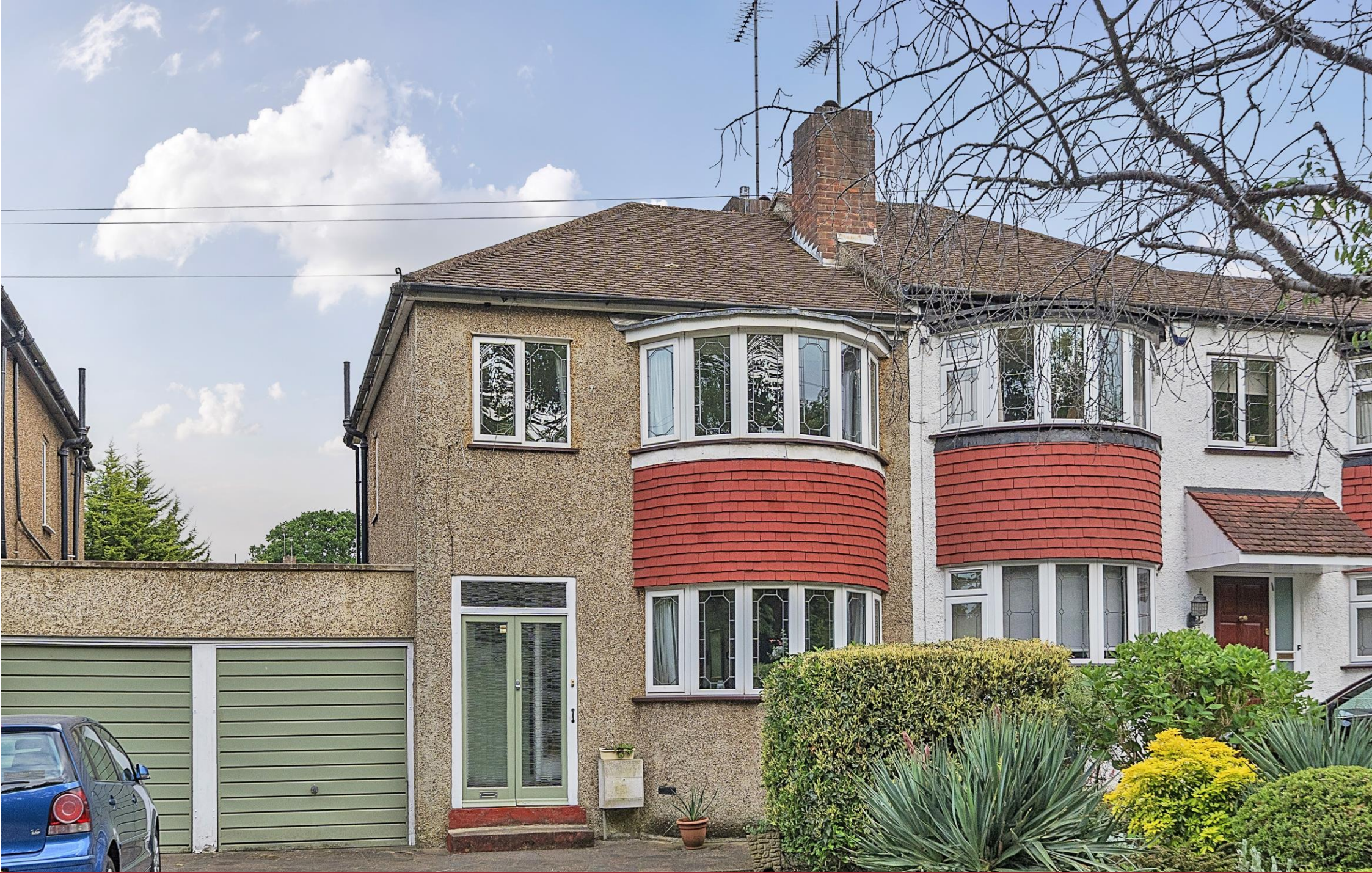
Avondale Avenue, Barnet, EN4 8LT Asking Price: £625,000 Freehold