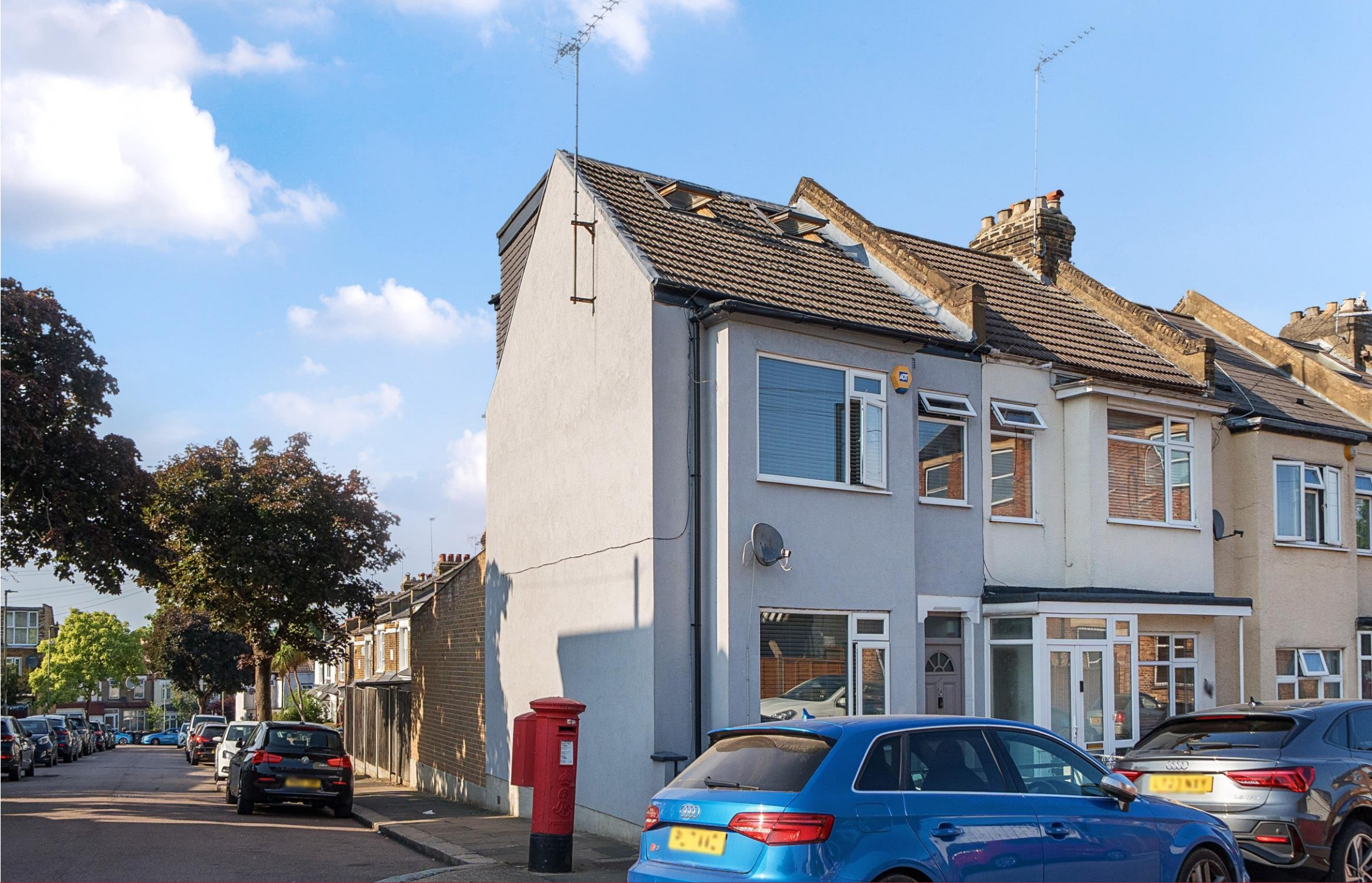
Brunswick Avenue, London, N11 1HP